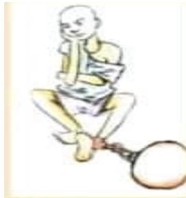
Stop Child Mistreatment