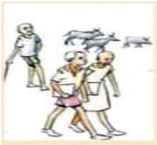
Stop Denying Children Education