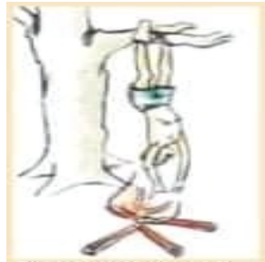
Stop Corporal Punishment