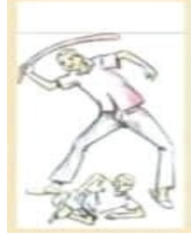
Stop Beating Children Excessively