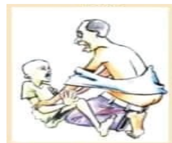
Stop Engaging Children in Sexual Activities