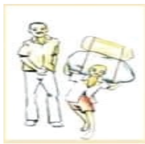
Stop Child Labor