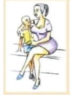
Stop Child Sexual Abuse