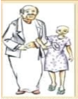
Stop Child Marriage

Act now to STOP all forms of violence against children during and after COVID-19 Pandemic