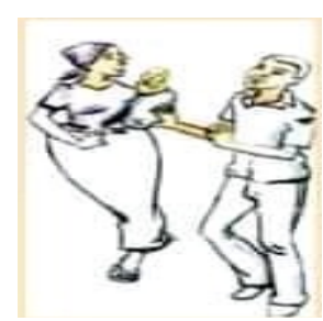
Stop Denying Responsibilities to Children